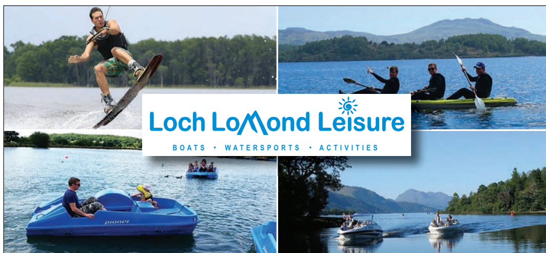
Figure 2: Online advertisement for Loch Lomond Leisure, 2017