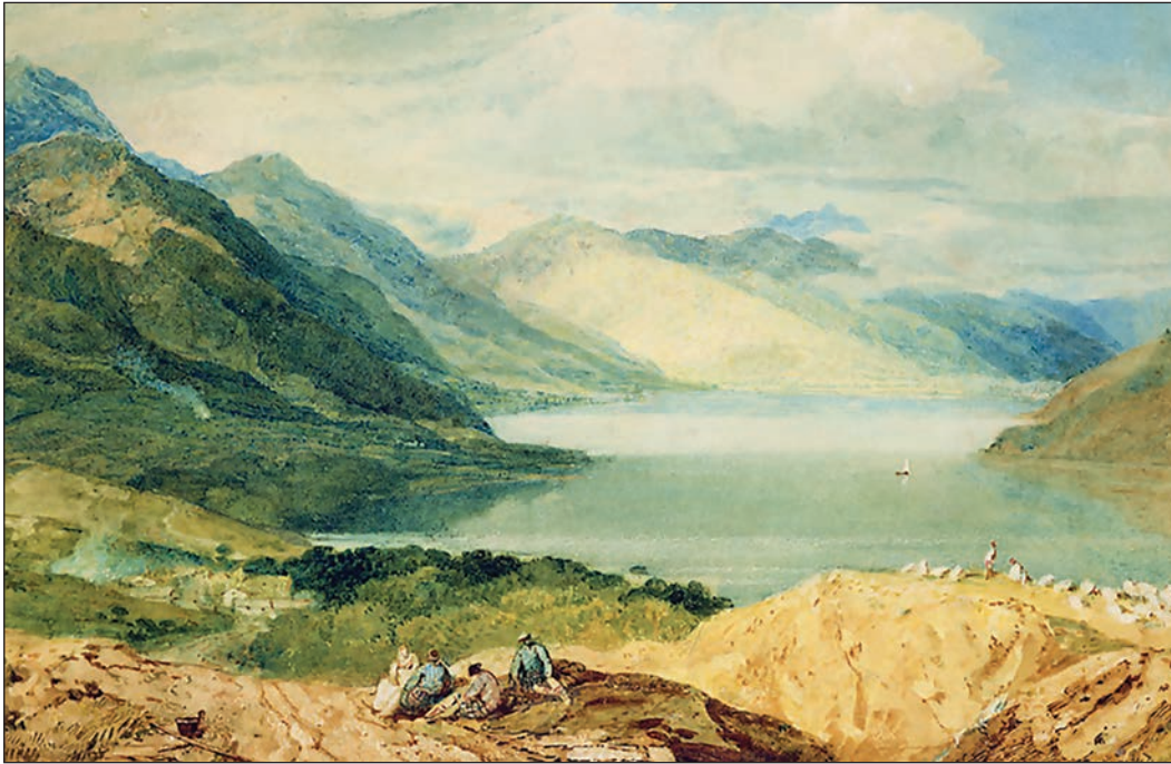
Figure 1: Painting of Loch Lomond, Scotland by W.M. Turner, 1834

Make the fullest possible use of examples and data to support your answers.